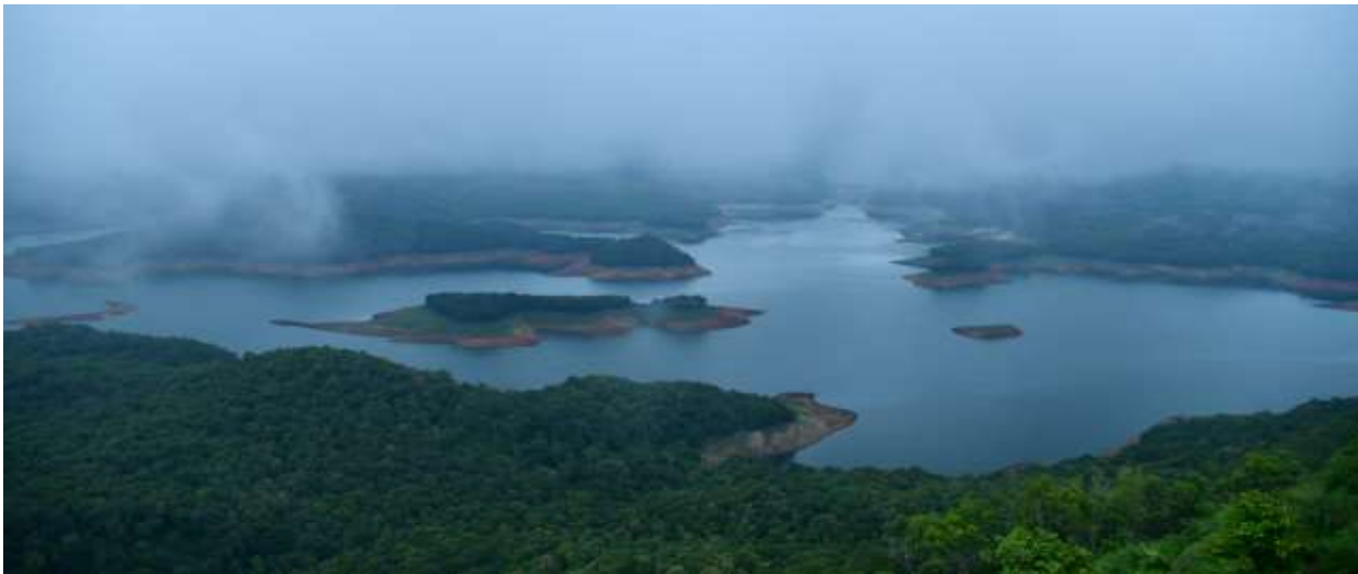
Actual Image from the site

Idukki, a land of Spice. graced by nature's poetic elegance, time stands still in this part of the world. Nature is at its best here. Get caressed by the beauty, the mist, and the wild! Rich heritage and strong historic backing, this place never fails to amaze. Aimed at making the most out of this tourist setting, The EalakkaRetreat is ideal for smart investments.