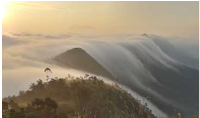
Actual Image from the site

Ealakka Retreat represents an opportunity to own a luxury villa and hotel project situated in Idukki, Kerala's premier highland resort. The project aims at being a tri-fold profit investment portfolio that consolidates the benefits into Ecotourism, environmental and personal profits. The tri-fold profit making proposition "When you invest with us, it starts with a property, continues in organic spice farming and ends up as a holiday home for you".